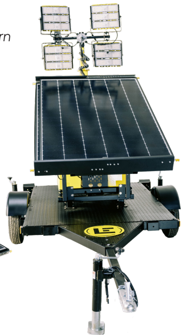
* Trailer Solar Light Tower LE978LEDVSOLAR-TRAILER