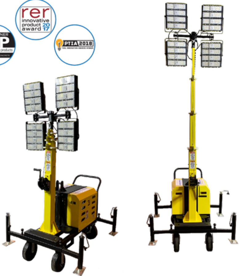
LE980LEDV-T4 Four Ultra Efficient LED Lights Two light head option available!